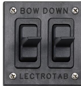
SAB-S Bat Handle Rocker Switch

Lectrotab's new flat rocker switch has improved sealing to prevent water entry and recessed rocker to prevent breaking. Rocker switch controls are available in either flat or bat handle style. They are specially designed to provide an "instant stop" circuit when the switches are released, thus preventing actuator over-run. This control can be upgraded with an LED tab position indicator. The gasket sealed switch is designed to prevent water entry. The control switch is self-contained and does not require an additional control box. Switches are available for single or dual station applications.