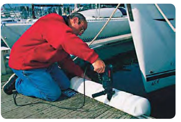
The Bumper can be secured with screws on the pontoon.