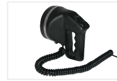
Bremen LED back