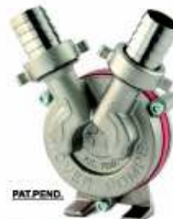
NOVAX DRILL 25