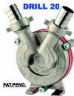
NOVAX DRILL 20