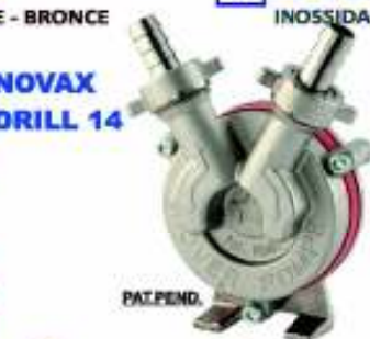
NOVAX DRILL 14