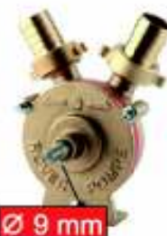
Ø 9 mm