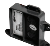
BE9006 Electric field sensor switch with built-in 30 second time delay suitable for use with 12V d.c. or 24 V d.c. pumps