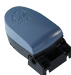
BE9002 Floatswitch suitable for use with 12 V d.c. or 24 V d.c. pumps Note: (Up to 15 amp rated 500, 950, 1300 Orca models)

Whale high quality bilge accessories including electric bilge switches, non-return valves, elbows and Y pieces. Page 48 - 51